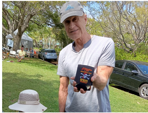
Happy to be winner of a koozie and free pass to Smugglers Cove Adventure Golf.