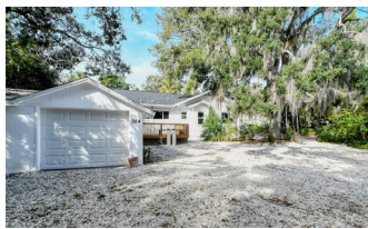
984 INDIAN BEACH DRIVE SOLD - $610,000