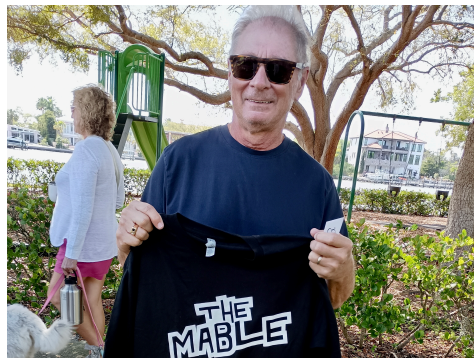
Lucky winner of a cool shirt and $10 gift card to The Mable.