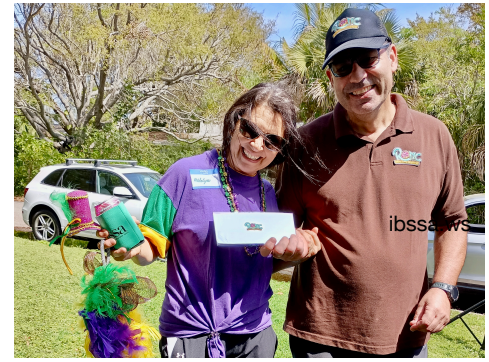
Happy recipients of a gift card from RONC's Donuts.