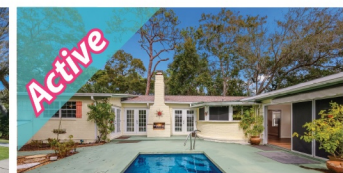
4050 Turks Cap Pl - $749,000