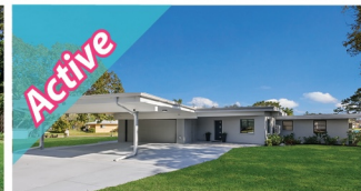
608 69th Ave W - $1,400,000