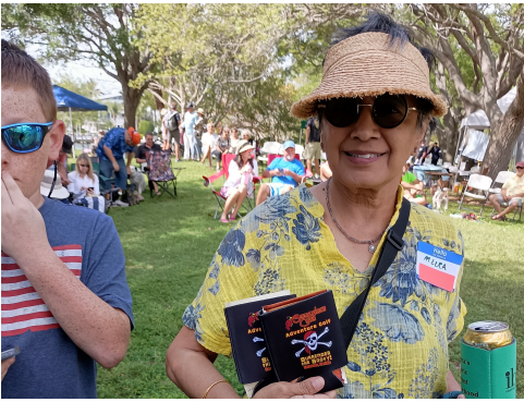
Happy to be winner of a koozie and free pass to Smugglers Cove Adventure Golf.