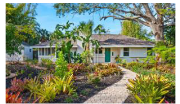
4845 WINCHESTER DRIVE PENDING SALE - $899,000