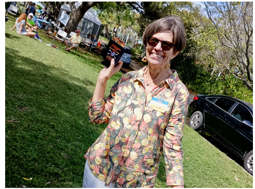
Happy to be winner of a koozie and free pass to Smugglers Cove Adventure Golf.