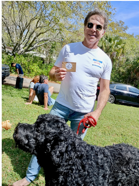
Happy recipient of a gift card to Mama G's.