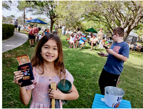
Happy to be winner of a koozie and free pass to Smugglers Cove Adventure Golf.