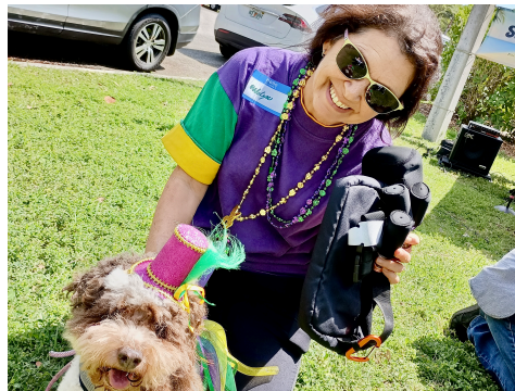
Winner of the doggie costume contest. Fanny pack donated by North Trail Liquors.