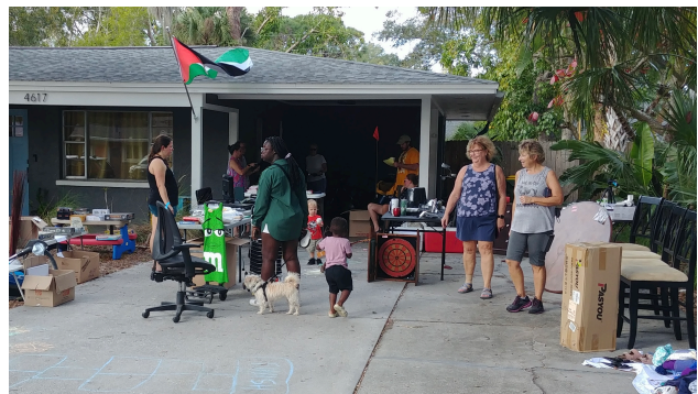
Great deals to be found!