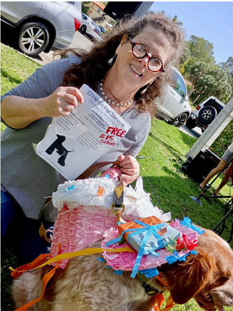
Second place in Doggie Costume Contest. $15 gift certificate from D'Hero's Pet Services.