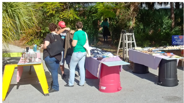
Books, housewares, clothes and more!