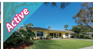
815 Patterson Dr - $900,000