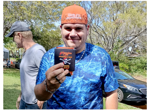
Happy to be winner of a koozie and free pass to Smugglers Cove Adventure Golf.