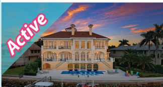
309 Ringling Point - $8,190,000