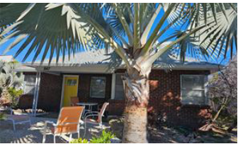
847 MYRTLE STREET OFFERED FOR $689,000