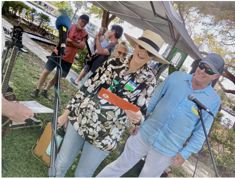
These folks who left Longboat Key for our neighborhood won tickets to Discover SRQ Tours!