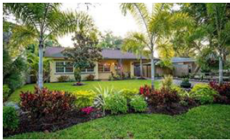
3016 BAYSHORE CIRCLE OFFERED FOR $699,000