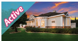
5102 Winchester Dr - $2,250,000