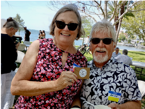
These happy folks got a gift card to Mama G's.