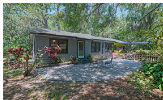
4103 TURKS CAP PLACE SOLD - $665,000