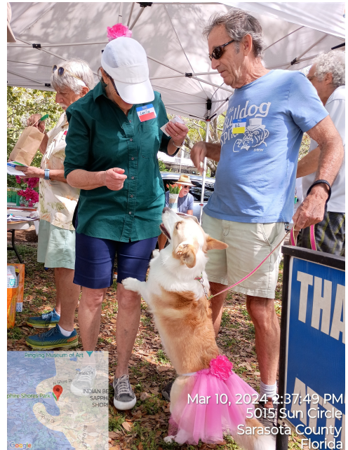
"Mom, when can I go to the Sarasota Ballet for lessons?"