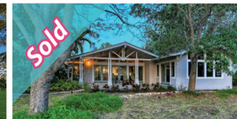
5022 Sun Circle - $1,300,000

We are the Brokers with the most local knowledge and also the largest global footprint. It does not cost more to hire the best!