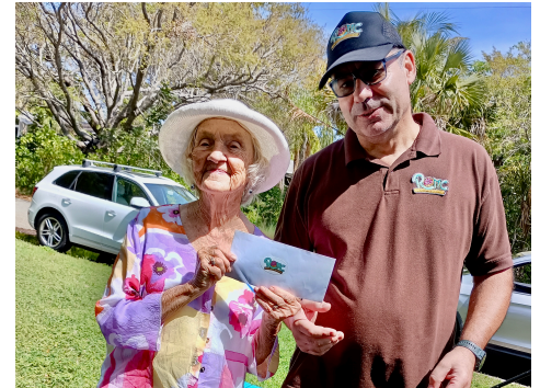
Happy recipient of a gift card from RONC's Donuts.