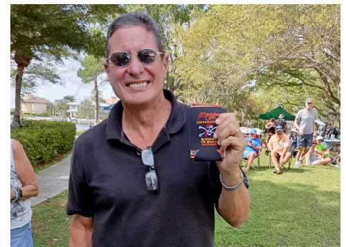
Happy to be winner of a koozie and free pass to Smugglers Cove Adventure Golf.