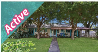
5246 Bay Shore Rd - $749,000