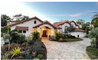
4931 BAY SHORE DRIVE SOLD IN 3 DAYS - $2,100,000