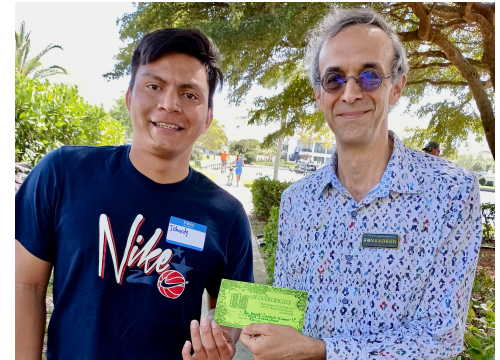
The winners of the Cornhole Contest got a gift certificate from Shelf Indulgence Used Bookstore and Cafe.