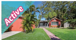
1031 Indian Beach Dr - 449,000