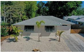
1057 22ND STREET OFFERED FOR $599,000