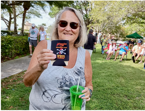
Happy to be winner of a koozie and free pass to Smugglers Cove Adventure Golf.