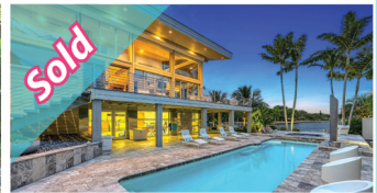
314 Ringling Point - $3,999,999

We are the Brokers with the most local knowledge and also the largest global footprint. It does not cost more to hire the best!