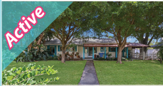
5246 Bay Shore Rd - $848,000