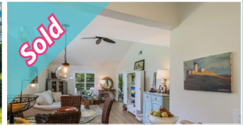
4741 Village Gardens Dr - $325,000