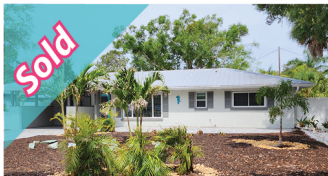
5035 Stevens Dr - $625,000