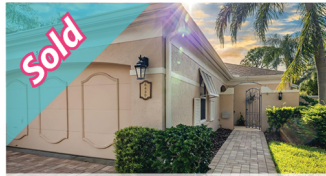
5430 Chanteclair - $507,500