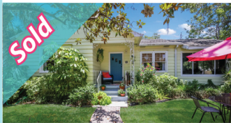
4704 Winchester Dr - $475,000