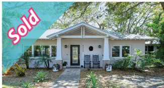
5330 Winchester Dr - $875,000