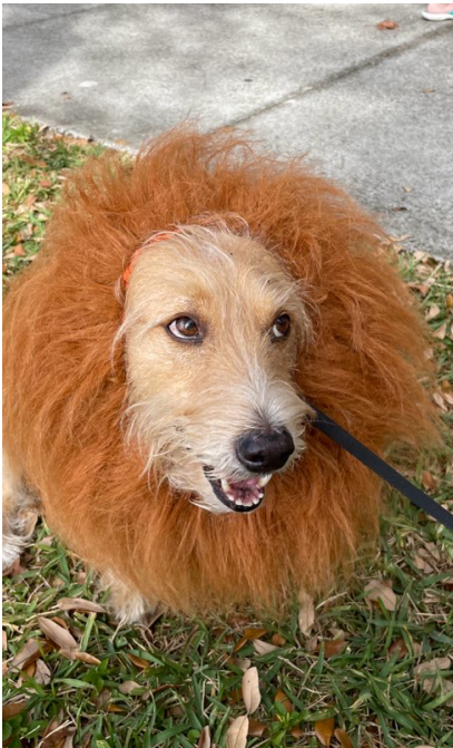
Alex, the "Lion"