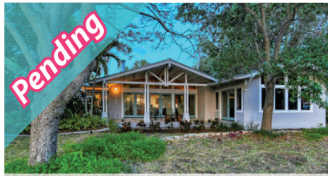
5022 Sun Circle - $1,498,000