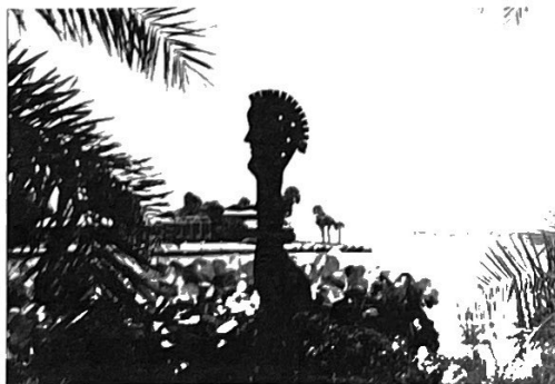
Aborigine is located in Sapphire Shores Park.