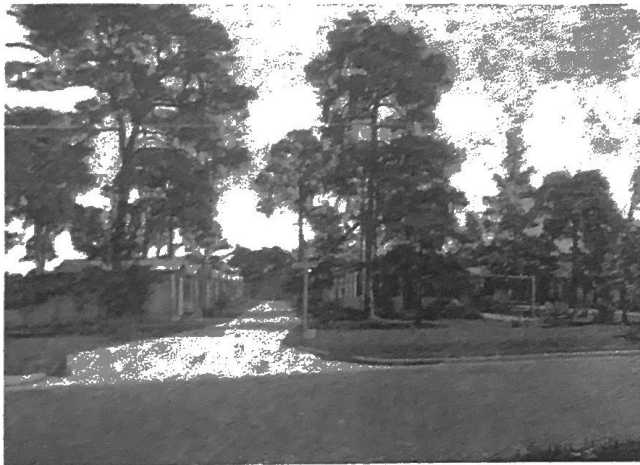
LAFAYETTE CABINS, U. S. 41 N., SARASOTA, FLA.

Editor's Note: We are very grateful to the Bay Shore Mennonite Church for providing space for the IBSSA semi-annual membership meetings and monthly board meetings.