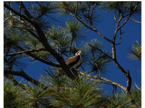
Osprey in a pine tree.