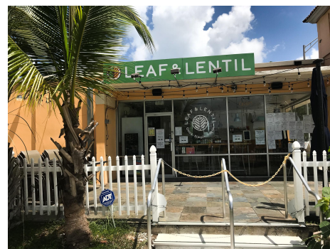
Leaf and Lentil is open for take-out.