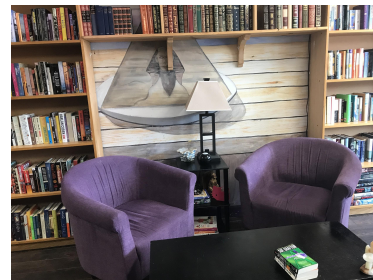
Relax and read at Shelf Indulgence Cafe.