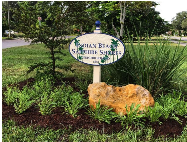
Newest IBSS neighborhood sign.

Consider donating! Every little bit helps our neighborhood flourish. Materials for Greenspace stewardship activities are paid for with volunteer donations.