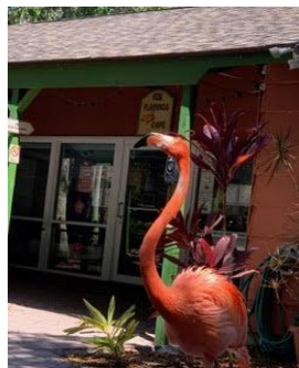
Kazi The Flamingo Ambassador