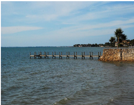
Sarasota Bay.