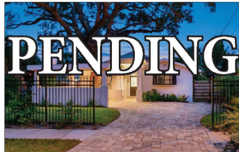
1100 Sylvan Drive Pending Sale! $849,000 SOLD in 2 Days by the Hayden Team