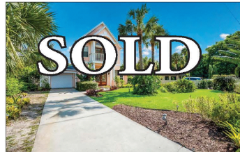
420 Sapphire Drive SOLD! $330,000 SOLD by the Hayden Team