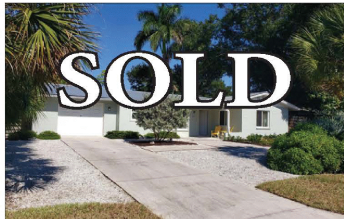
637 Corwood Drive Pending Sale! Listed and SOLD by the Hayden Team