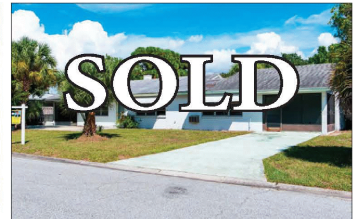
3510 Iroquois Avenue SOLD! $220,000 Listed and SOLD by the Hayden Team

The Hayden Team... we list, we sell, we get results. Call us and see why we have been so successful in your neighborhood.