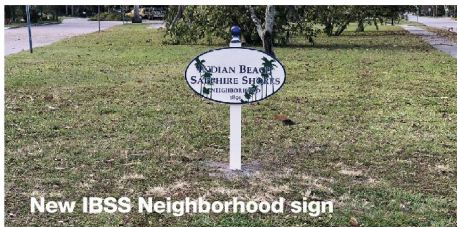
New IBSS Neighborhood sign