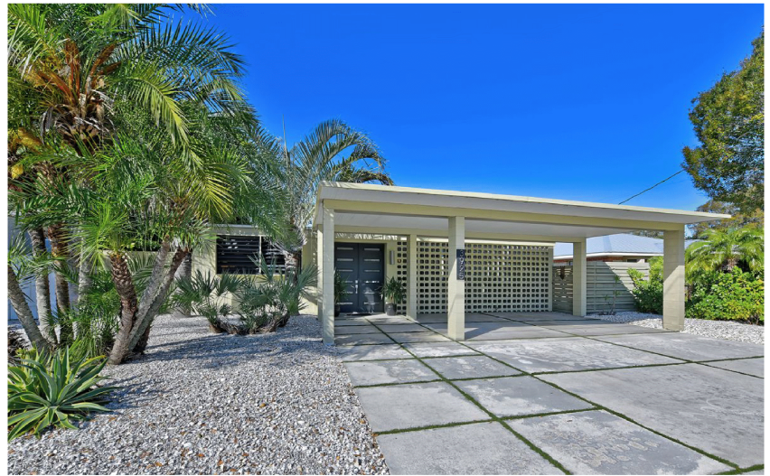
3925 Chapel Drive, Sarasota