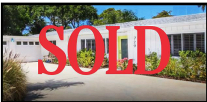
729 Indian Beach Circle SOLD for $550,000