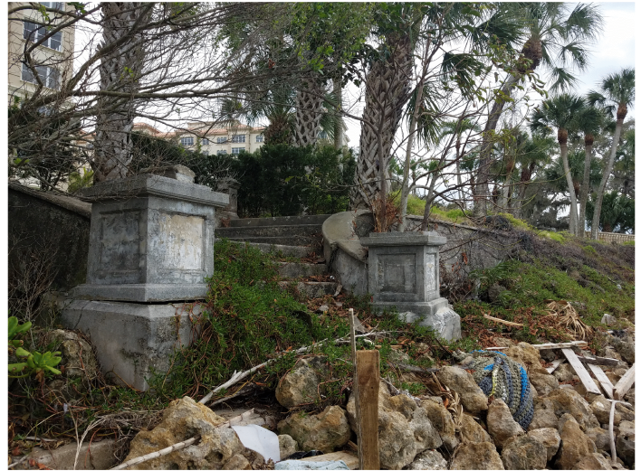
Waterfront entry to The Acacias