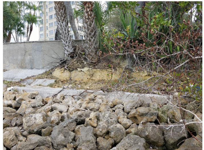
Barely visible today, The Yellow Bluffs are an outcropping on Sarasota Bay obscured by development