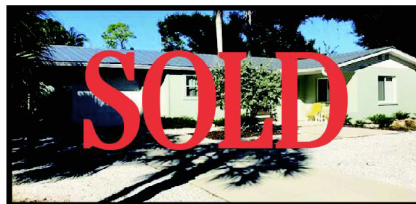
937 Corwood SOLD for $294,000

In the past 15 months the Hayden Team has sold 36 homes