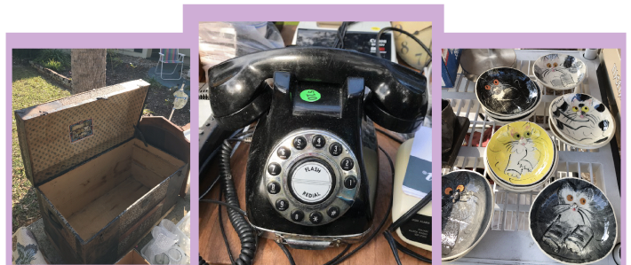
See yard sale photos on Page 6