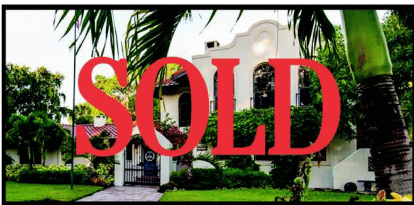
2833 Bay Shore Circle SOLD for $975,000