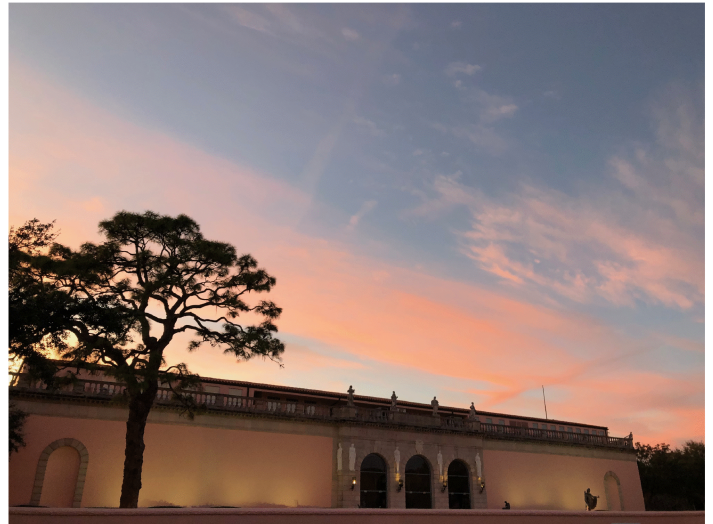
Joel Werth captured this image of a January sunset over The Ringling.