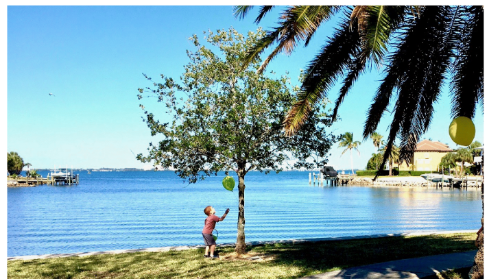
Egg Hunt 2017