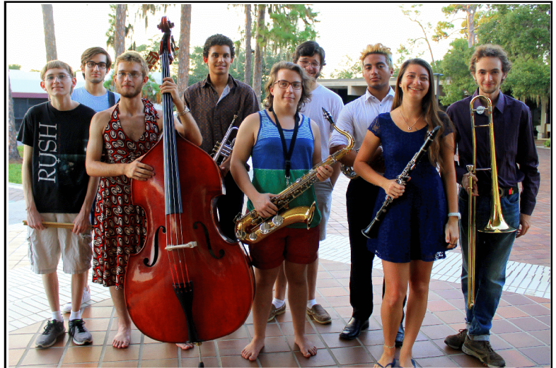
"THE NEW CATS" JAZZ BAND will perform at the picnic on Sunday, November 8, 2015 at Caples Campus on the Bay.

Bring your canned and other food donations to the picnic for the 2nd Annual Food Drive in IBSS. (See article on page 4.)