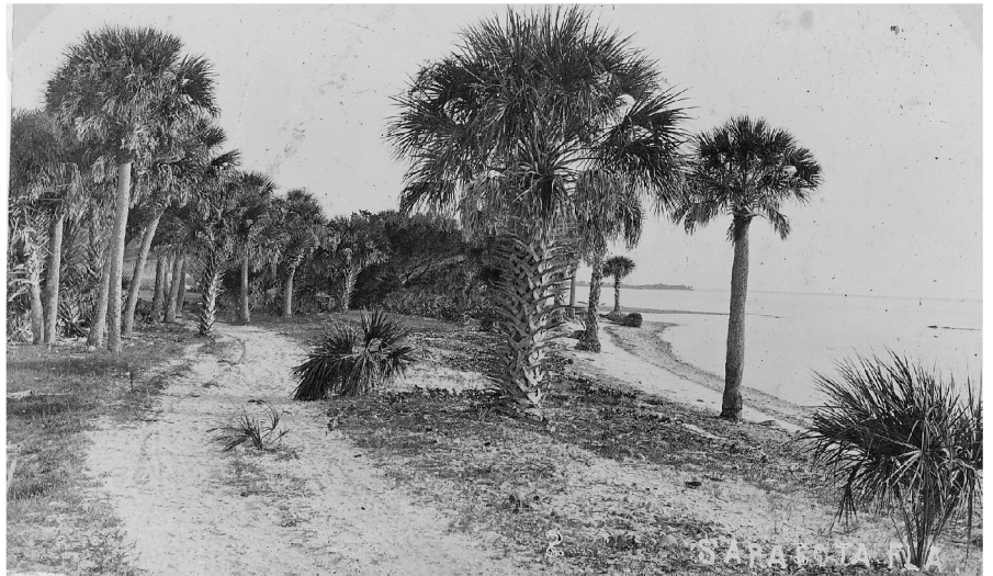
1918 Postcard of Indian Beach