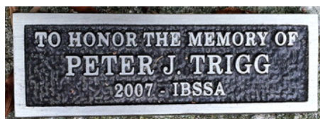
(Black Olive tree was planted)