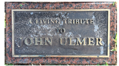
(Mahogany tree was planted)