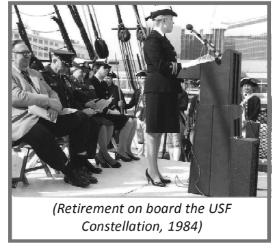
(Retirement on board the USF Constellation, 1984)

Lakes, and a female Navy Chaplain gave the benediction. The Navy Academy Band played; a flag was flown over the Constellation and lowered to Auld Lang Syne ; and the Maryland National Guard were on board in their period costume."