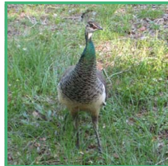
The blue male peacock (on the cover of this newsletter) along with the green female peahen (left) are wild and living in the Indian Beach neighborhood.

We at Sarasota Jungle Gardens sometimes get frantic callers concerned that the colorful Peacocks seen in the area are ours.