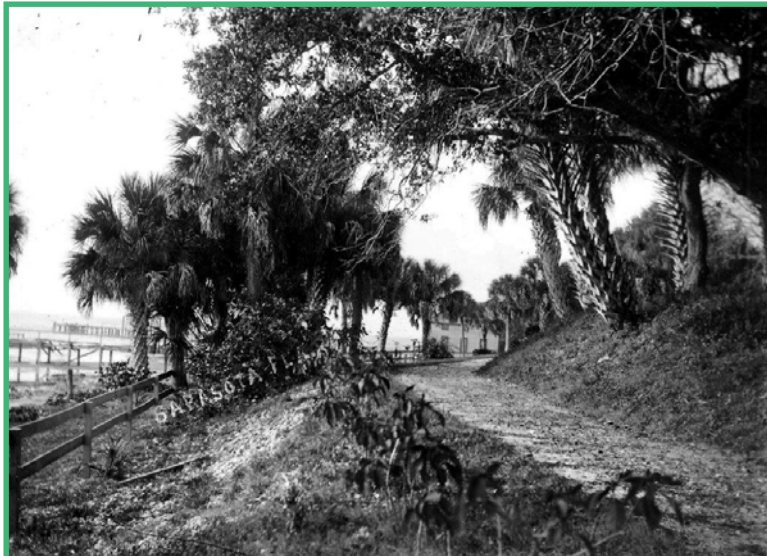
Bay Shore Road as it wraps around an Indian Shell Mound, which is believed to still be in existence in the Alameda Avenue neighborhood.