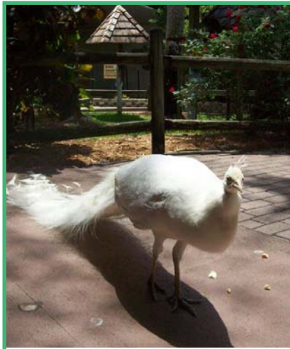
Years ago, Buster jumped the fence and made Sarasota Jungle Gardens his home.

Peacocks are a member of the pheasant family. There are many sub-species featuring a variety of colors, including all white. The term Peacock is often used to describe both the male and female, but technically only the male is a Peacock. The proper name for the female is Peahen.